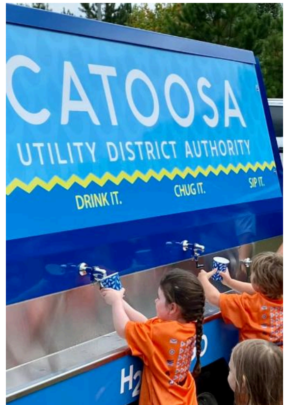
Apex Fun Run at Woodstation Elementary School